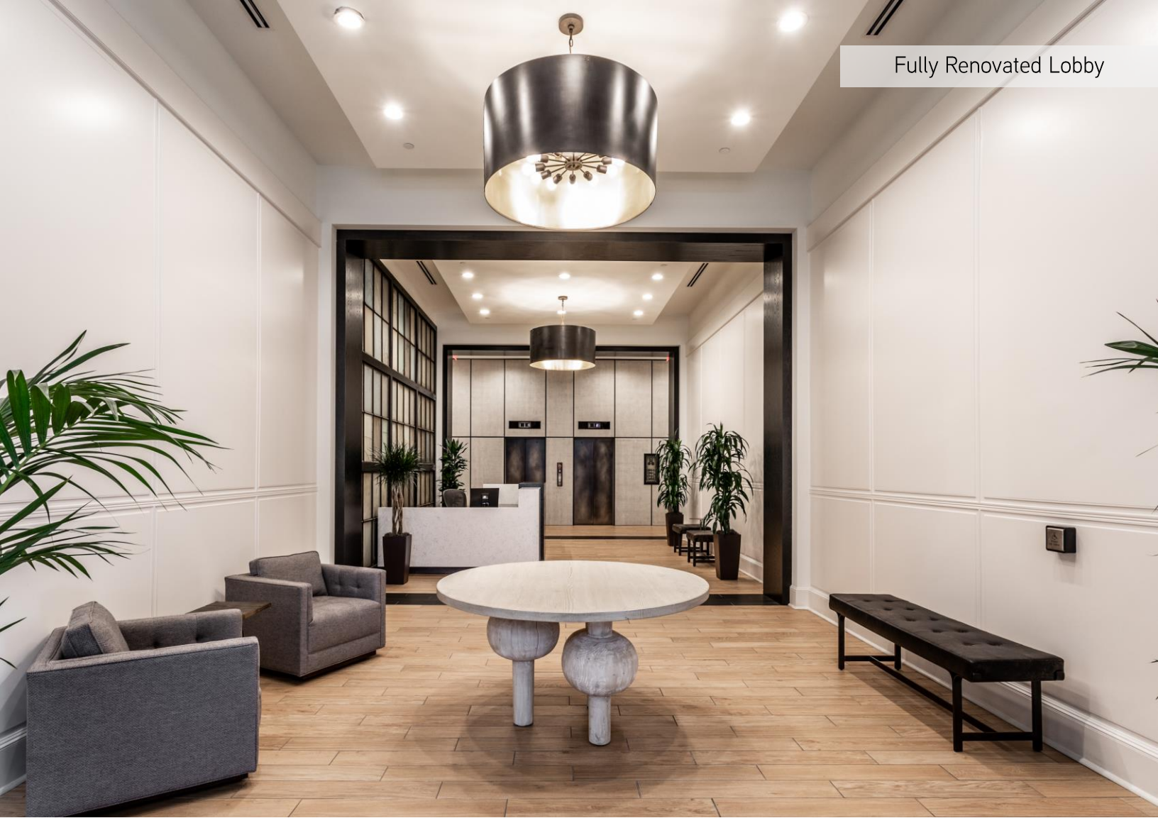
Fully Renovated Lobby